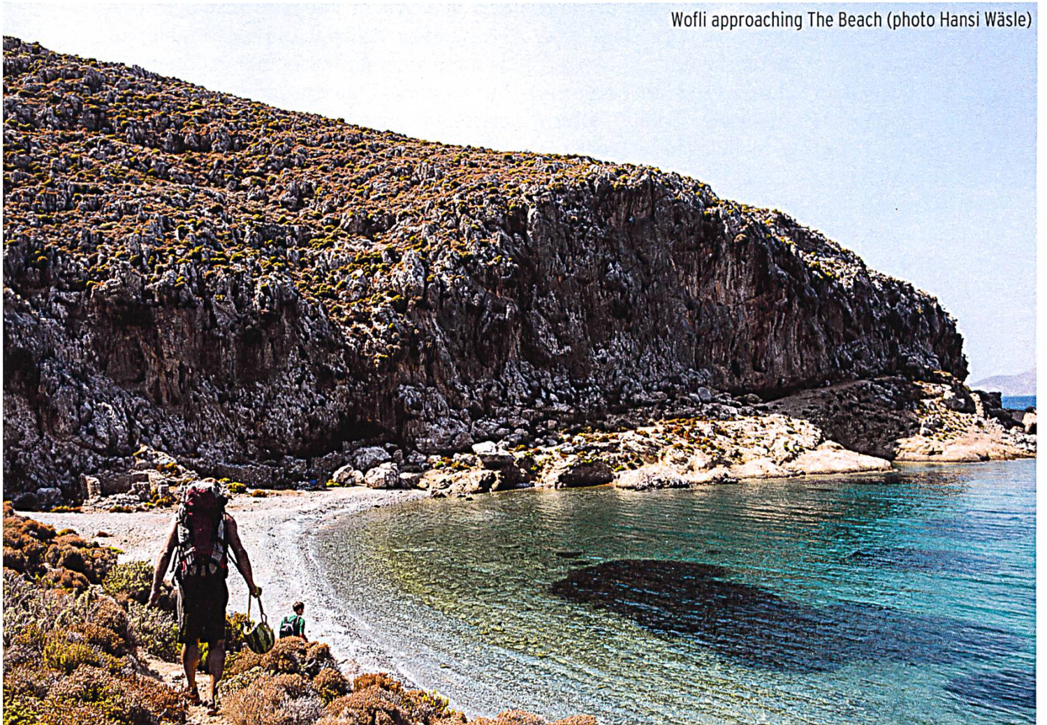
Wofli approaching The Beach