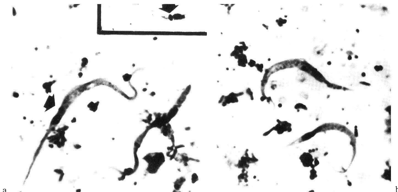
Fig. 1. Epimastigotes of T. cruzi and T. rangeli in faeces of R. prolixus . Faeces were air dried onto a microscope slide, fixed in methanol and stained with Giemsa's stain. a) Experimental infection showing the larger T. rangeli and smaller T. cruzi epimastigotes. The two parasites have kinetoplasts of very different shape and size, that of T. rangeli is punctiform (arrowed) whereas that of T. cruzi is bar-shaped (arrowed in insert). b) Under less ideal, and more usual, circumstances the two parasites appear almost identical, T. cruzi epimastigote (below) could only be distinguished from that of T. rangeli with difficulty in this natural, mixed infection from a wild caught insect. (Magnification in each main photograph \times 2250 ).