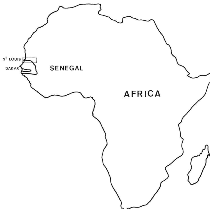
Fig. 1. Senegal in relation to other West African countries and the Senegal River Basin (□ area).

Two million people inhabit this region (Moulinier and Diop, 1974). Villages are categorized as to their source of water; those using river water are classified as walo (practizing flood water recession agriculture); those using wells and temporary rain-fed pools, are diéré (rain-fed agriculture).