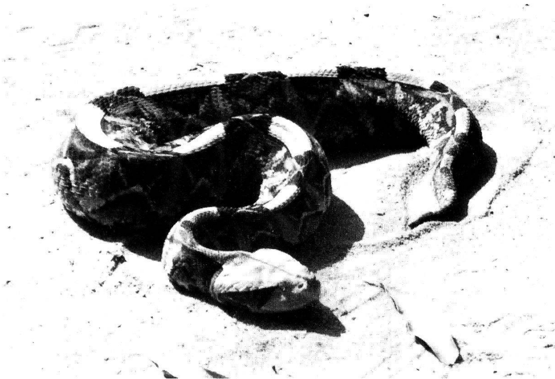
Fig. 2. Bitis gabonica .