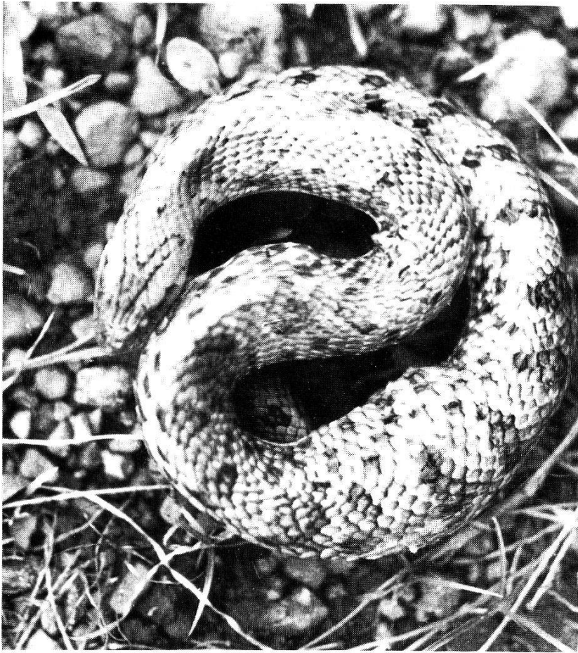
Fig. 1. Causus maculatus . The most common snake on the plantation.