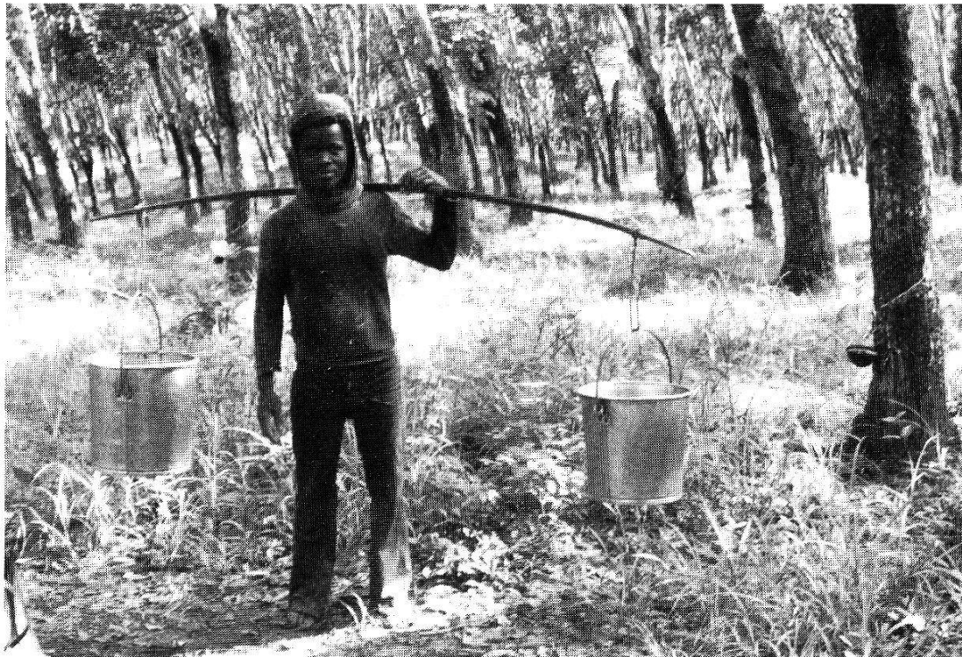
Fig. 4. A tapper on the plantation.