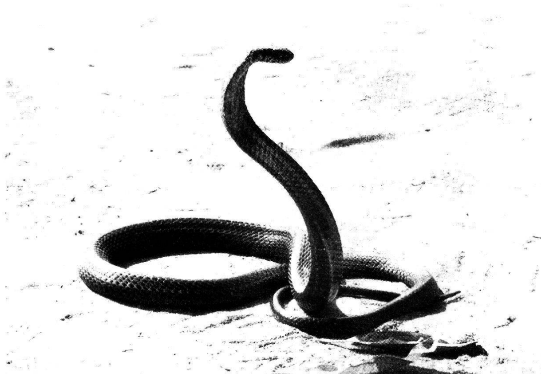
Fig. 3. Naja melanoleuca .

ber to April and a rainy season from May to October. According to the annual census of 1978 there were 44,547 registered inhabitants.