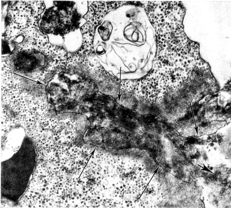
Fig. 6. Section has gone through the tail of Entamoeba , which shows a cleft (marked by arrows). The broad arrow shows the direction in which the excretory products are coming out. 21,000 \times .