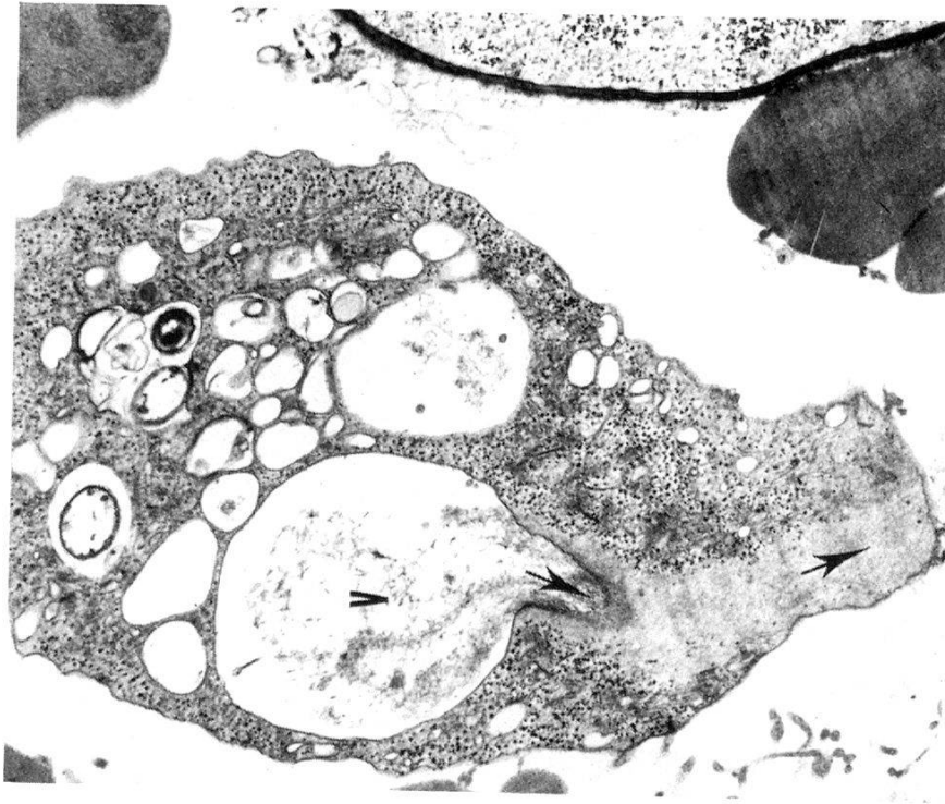
Fig. 8. The cleft of the tail has completely disappeared, but there is a clear ectoplasmic band running from the vacuole (v) to the tail probably indicating the area through which the excretion had taken place. Note the posterior portion of the vacuole is elongated and the vacuolar membrane is interrupted at this point (marked by an arrow). 5,600 \times .

expelled, the two portions, one inside the cytoplasm and the other outside were momentarily connected by a thin tubular structure (Fig. 1). As these two portions of the vacuole moved away from each other the tubular structure ruptured (Fig. 2). Finally the cleft in the tail closed and the expelled vacuole was left behind as the Entamoeba continued its forward movement (Fig. 3, 4, 5).