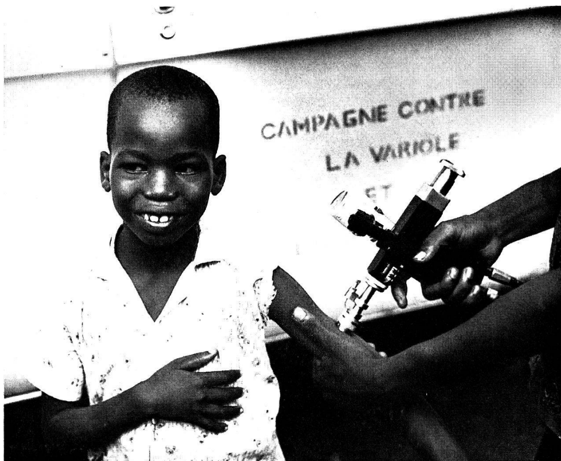
The Ped-O-Jet model automatic jet injector.