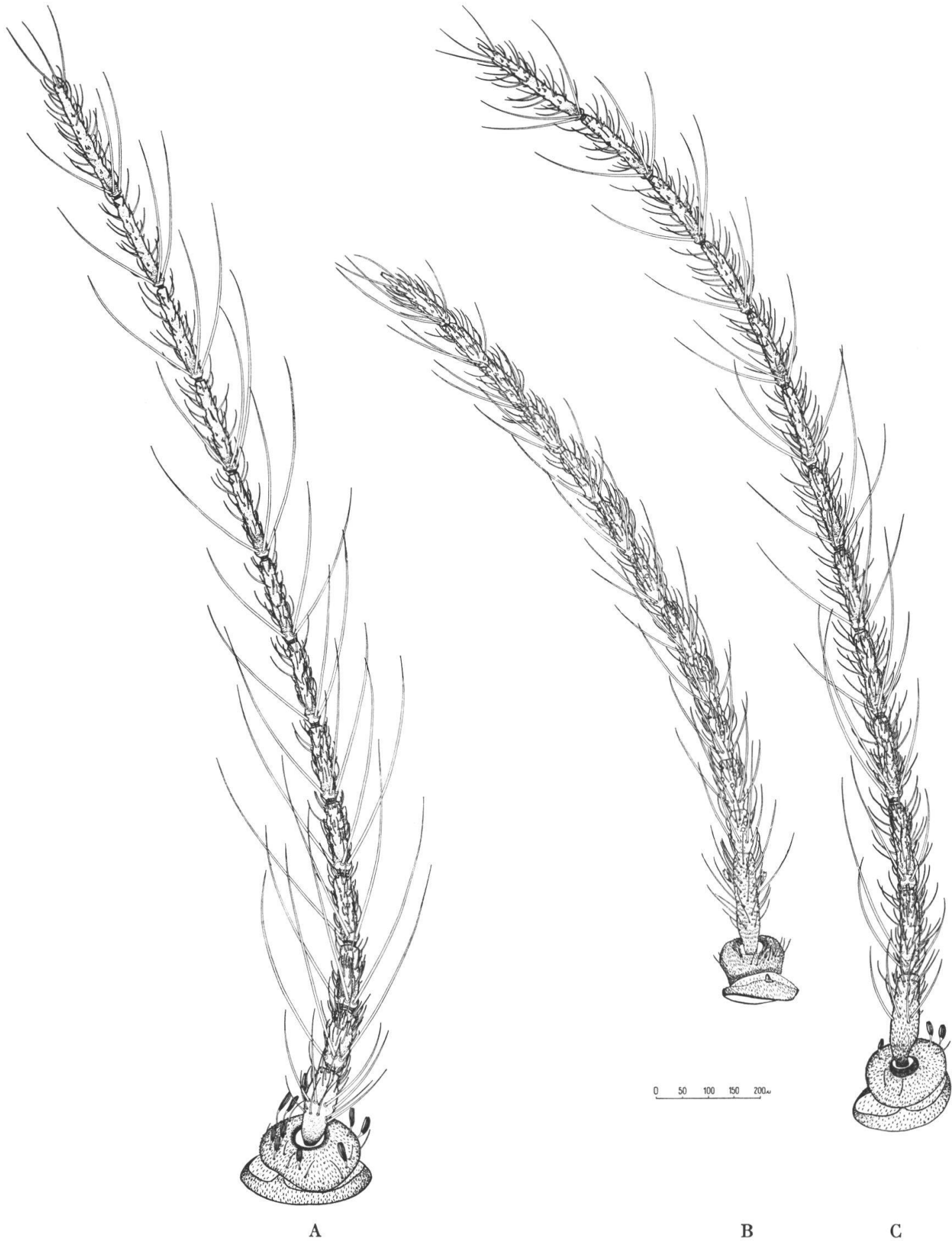
Fig. 1. Antennae of female mosquitoes with the sense organs distributed on their walls. A: Aedes aegypti . B: Anopheles maculipennis . (Drawn from ISMAIL, 1962.) C: Culex pipiens . Magnification 700 \times .