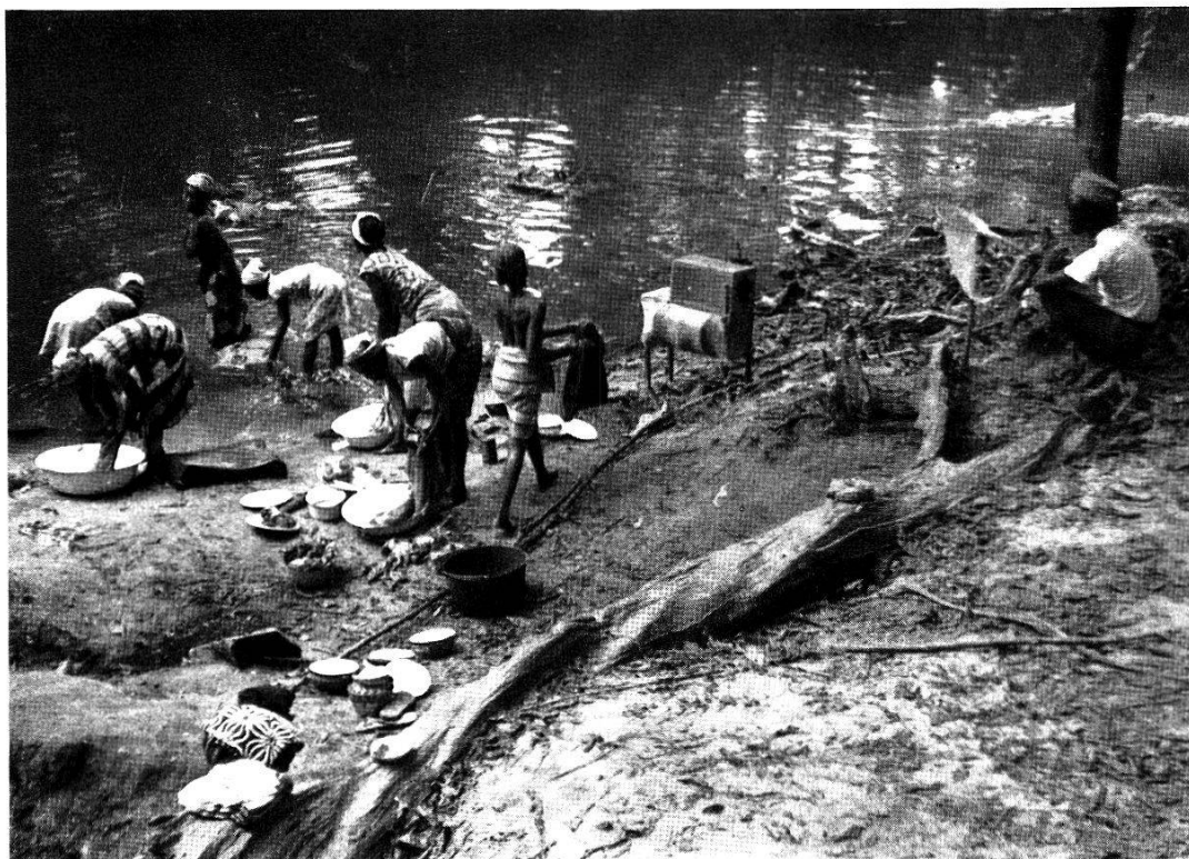
Fig. 4. A washing place on the Zeliba river in the well populated country close to Voinjama, Northern Liberia. Many species of Tabanus and occasionally Chrysops longicornis were caught here. At this place 12 months continuous sampling was carried out by traps and by fly-collectors (seen at right of picture).