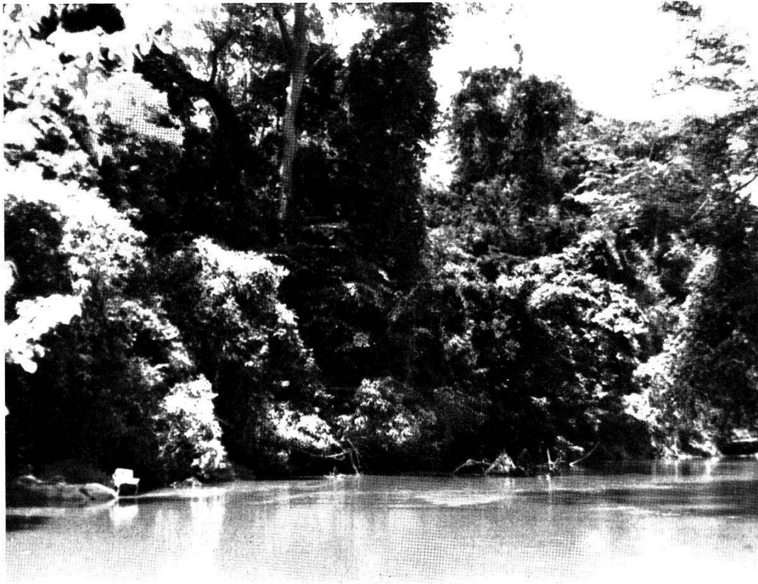
Fig. 3. A pool on the Lawa river, Liberia, visited by pigmy hippo and occasionally elephants. High catches of Haematopota torquens and of several species of Tabanus were made here. — This is deep in tropical Rain Forest. A trap can be seen on the bank at the left of the picture.