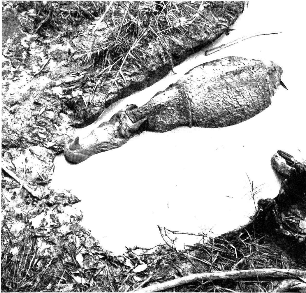
Fig. 4. Rhino bath.

It was a starry night when we caught our first animal. We sat in the hut, peering down at the trap, the contours of which rose faintly out of the darkness. Suddenly we heard a shrill, whimpering sound—something between the squeak of a little pig and the whine of a big dog. It was followed by a splash in the mud and the snapping of twigs. We held our breaths. At last a rhino was on its way down to the bathing-ground and the trap.