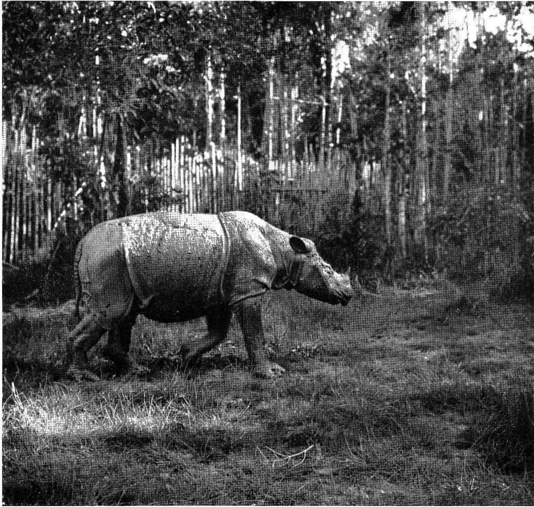
Fig. 6. One of the three captured females.

During our wanderings in the jungle we had learned which of the bushes the rhino preferred, and a large store of fresh leaves had been gathered early that morning. We placed a good supply of fresh leaves in one corner of the trap and retired. Soon after the rhino slowly advanced towards the pile and began breakfast.