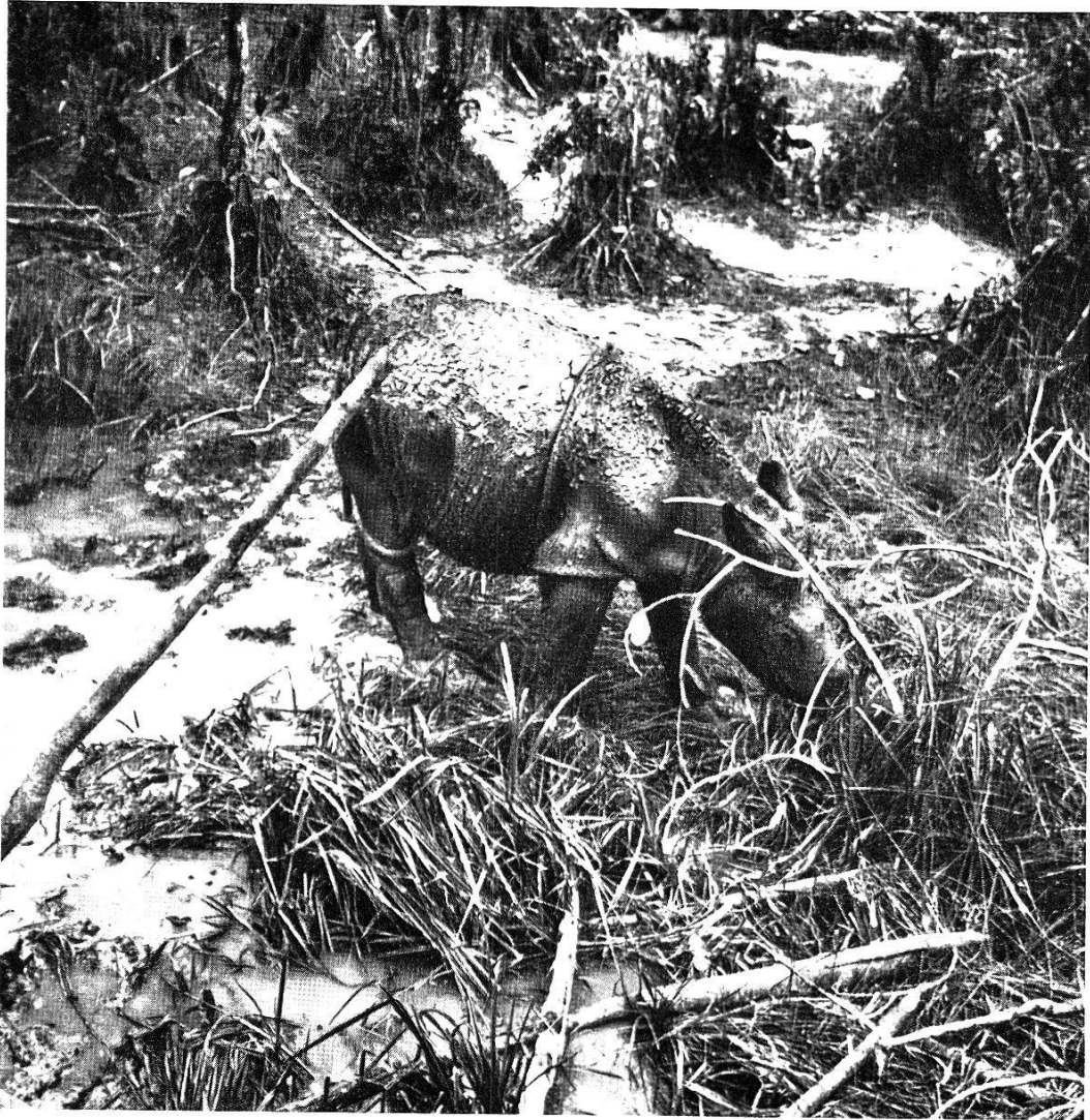
Fig. 3. Rhino near bathing place.

down when the animal passed through the opening. This kind of trap had previously been used by RYHNER in trapping successfully tapirs and the rhino "Betina".