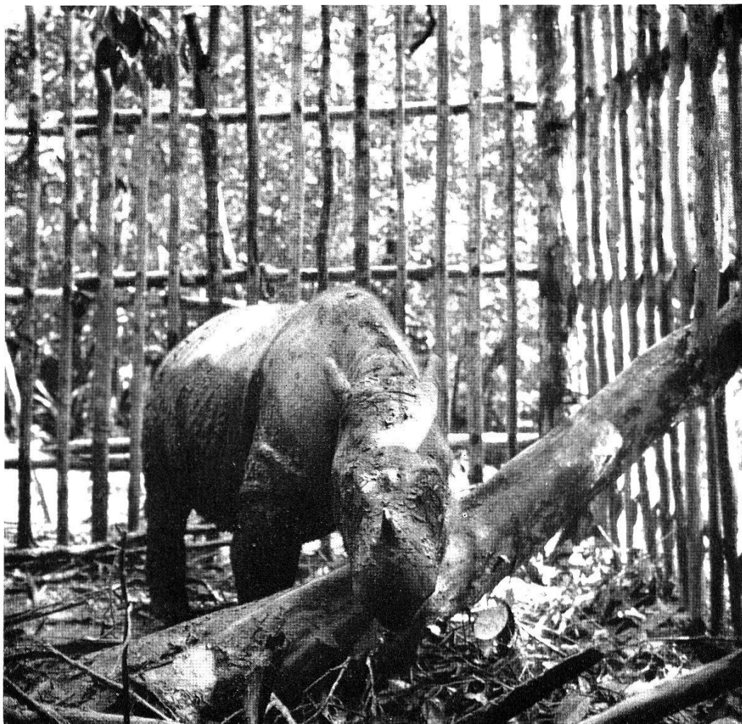
Fig. 5. "Subur" in the trap.

the poles and hit our faces with a smack. Finally it calmed down and retreated to a slough within the fence.