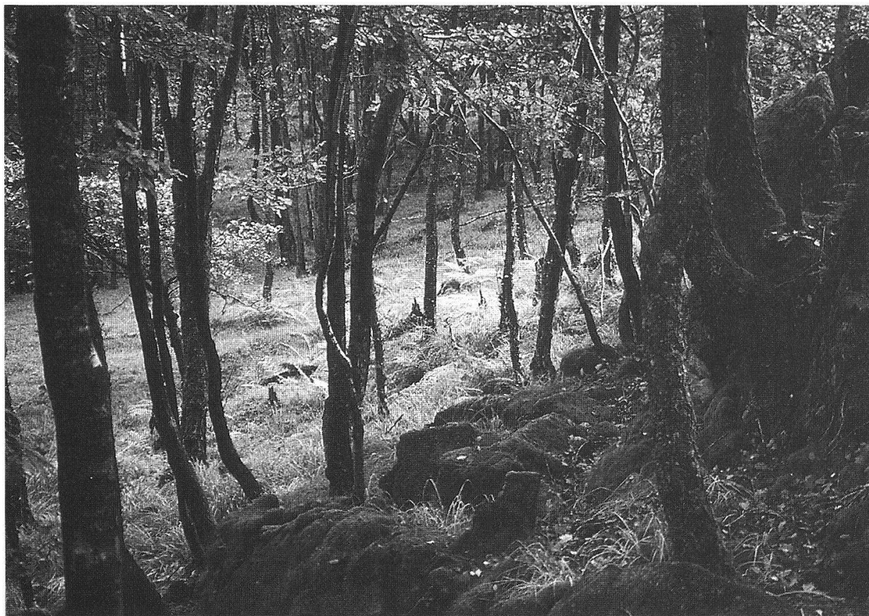
Fig. 2. Milkingstead wood, Eskdale. A typical "wet woodland" rich in ferns and bryophytes.

En route to our next site we saw, in the steep scree slopes above Wastwater, the rare shrubby cinquefoil ( Potentilla fruticosa ), an arctic relict that is now widely planted as an ornamental species. Wastwater is the deepest lake in the region at 76 m and is set in an impressive glacial landscape. The water is very base-poor, which results from the volcanic, acid geology which dominates the mountainous central Lake District. The landscape surrounding Wastwater is absolutely typical of this volcanic geology. On the edge of the lake we looked at an oligotrophic mire and our species lists grew. After watching what may be considered "an entertainment" in the Lake District (a farmer moving his sheep), we travelled 30 km inland to Helton Fell on the Eastern side of the region (Table 1, Fig. 1). Although overlying similar geology, Helton Fell provided a contrast to the wet woods and