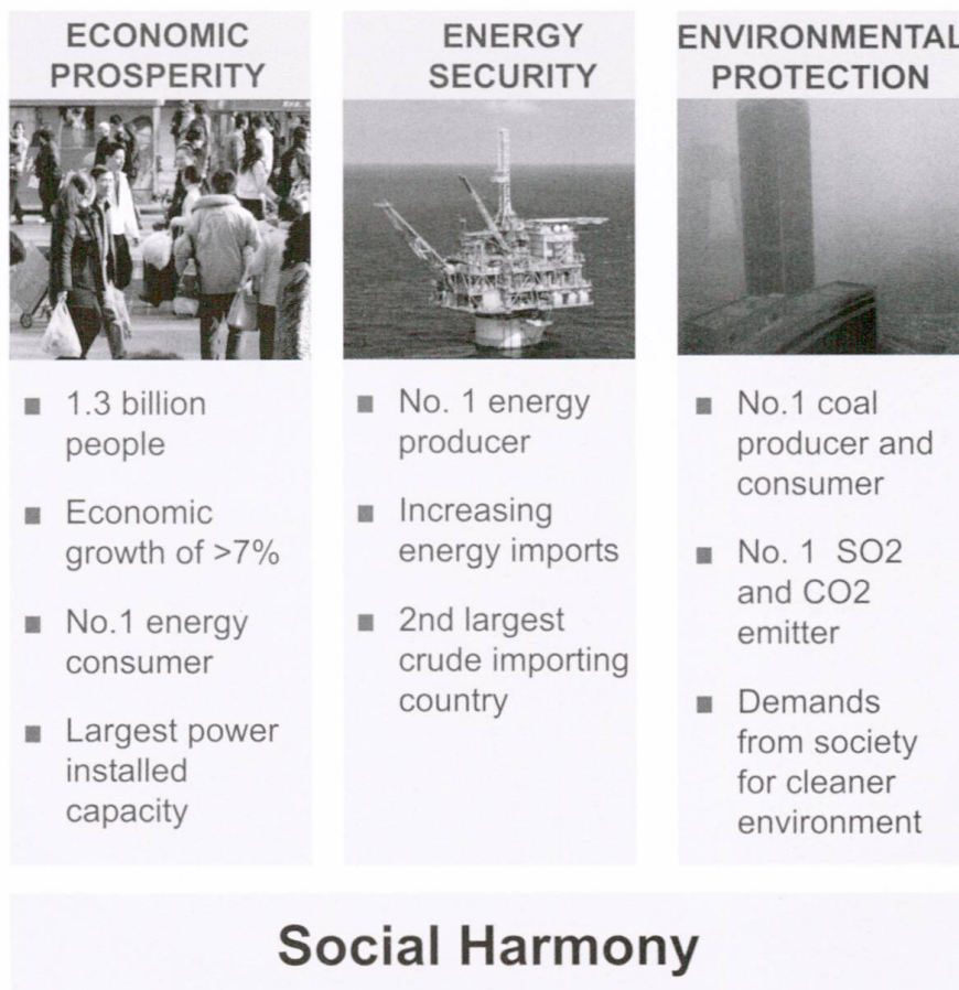
Fig. 1: The strategic drivers for China policy makers.

2012, Shell published its Onshore Oil and Gas Operating Principles. The company is making all of Shell's operated onshore projects where hydraulic fracturing is used to produce gas and oil from tight sandstone or shale, consistent with these principles and with local rules and regulations. The reason for making these public was in response to concern around the development of unconventional resources, especially with regard to the practice of hydraulic fracturing. It creates transparency as the public today demands and allows Shell to share «how we do our business». It also demonstrates confidence, which is based on 60 years of onshore operational experience, including the use of hydraulic fracturing, and underpins how the company works today and how it aspires to improve. The operating princi-