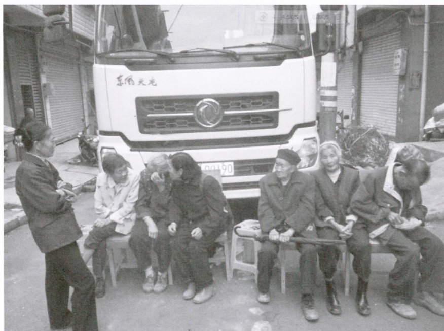
Fig. 5: Peaceful community protest.

Similar to the previously mentioned footprint reduction, successfully working with the community is understood by Shell as a prerequisite for success. People will make their sentiment felt by opposing an activity or blocking progress. Hence, regardless how good the geology is, if the relationship between community and company is not sustainable, the company will not be able to operate efficiently. Fig. 5 shows how easily operations are stopped when a community disagrees with a certain activity – in this case what was considered excessive trucking activity passing through a small village road. Likewise, when the relationship is based on mutual respect and trust, it can be