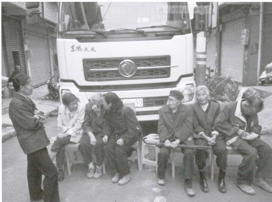
Fig. 5: Peaceful community protest.

Similar to the previously mentioned footprint reduction, successfully working with the community is understood by Shell as a prerequisite for success. People will make their sentiment felt by opposing an activity or blocking progress. Hence, regardless how good the geology is, if the relationship between community and company is not sustainable, the company will not be able to operate efficiently. Fig. 5 shows how easily operations are stopped when a community disagrees with a certain activity – in this case what was considered excessive trucking activity passing through a small village road. Likewise, when the relationship is based on mutual respect and trust, it can be