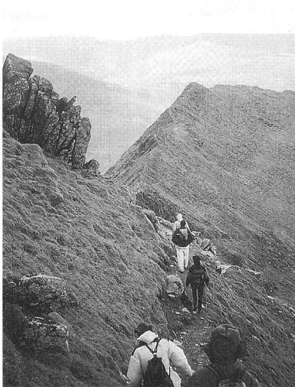
Fig. 3. Descending Helvellyn mountain (950 m a.s.l.) along Striding Edge.

some active demonstrations of restoration ecology. At Sandscale Haws we visited a wide range of habitats including dunes and dune slacks as well as some impressive long-term grazing exclosures (Table 1, Fig. 1).