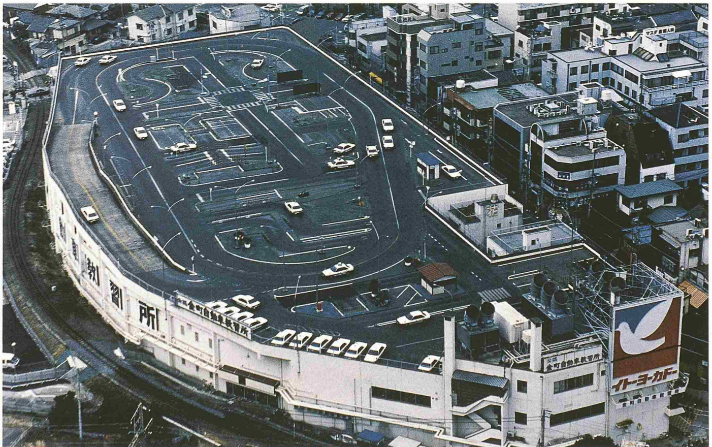
«Super car school»; function: supermarket + driving school/site: kanamachi, katsushika-ku: on top of the double layer supermarket lands a layer of driving school – the site includes the parcels of other people's property which could not be purchased – the condition of the site, framed by the curve of the railroad, is expressed directly in the extruded volume of the building – the entry ramp is framed above by the practice slopes for hand brake starts learner cars, etc.

The buildings of Made in Tokyo are not beautiful. They are not perfect examples of architectural planning. They are not A-grade cultural building types, such as libraries and museums. They are B-grade building types, such as parking, bathing centres, or hybrid containers including architectural and civil engineering works. They are not «pieces» designed by famous architects. What is nonetheless respectable about these buildings is that they don't have a speck of fat. What is important right now is constructed in a practical manner by the possible elements of that place. They don't respond to cultural context and history. Their highly economically efficient answers are guided by minimum effort. In Tokyo, such direct answers are expected. They