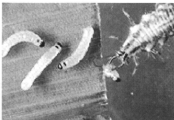
Fig. 1. Chrysoperla carnea larva feeding on early instar larvae of Spodoptera littoralis .

scapes, may improve their utilisation for human benefits (DeBach & Rosen 1991). Research on the biological control of pests as part of integrated management systems has demonstrated the economic importance of many parasitoid and predator species, e.g. the green lacewing Chrysoperla carnea Stephens (Neuroptera: Chrysopidae) in Europe and North America (Fig. 1). Larvae of this insect are commercially marketed for biocontrol purposes. They do not only prey on aphids, but also on many other arthropods from eggs to mature stages (Tauber et al. 2000).