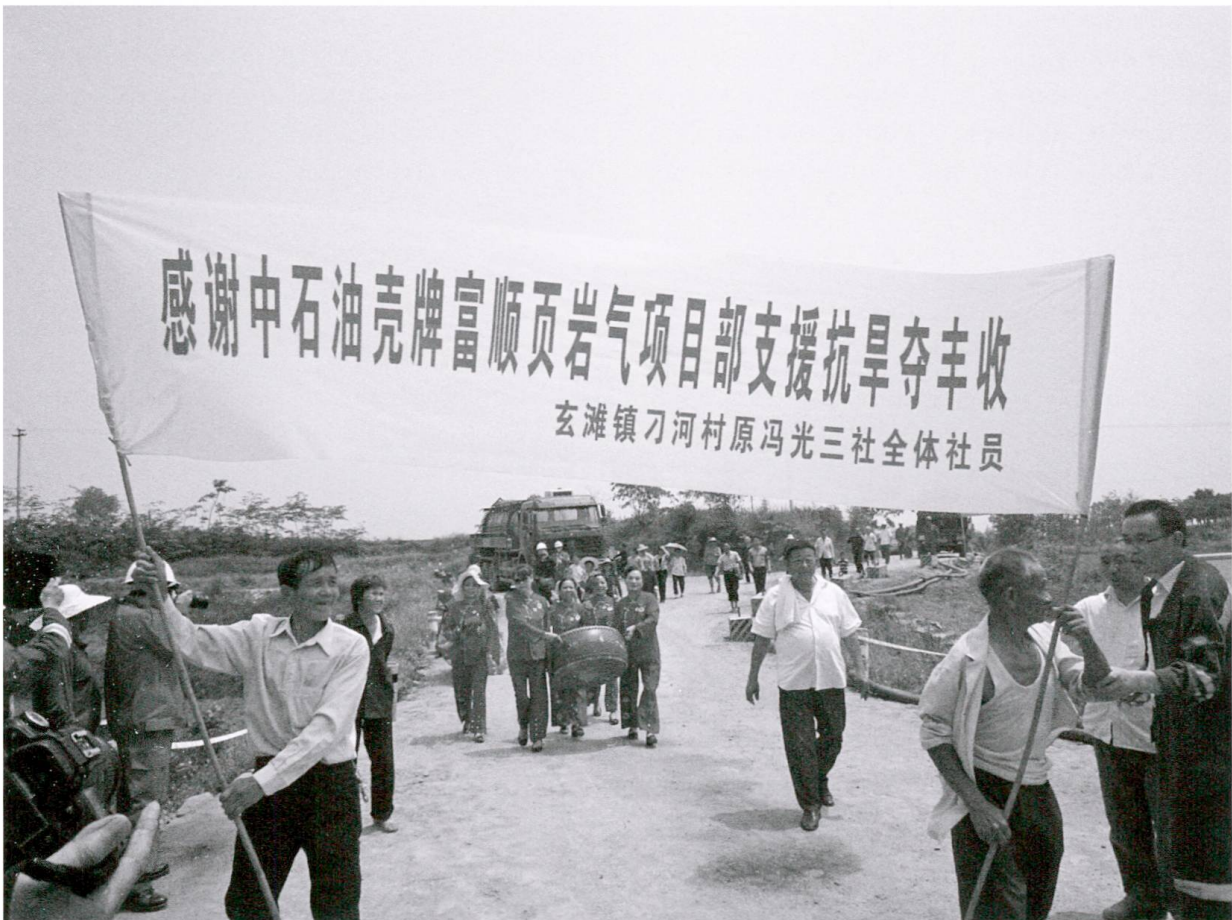
Fig. 6: Celebrating the completion of an irrigation project that was executed for a local farming community by Shell and PetroChina.

Having strong operating principles in place has proven essential for progressing Shell's operations in China. Adherence to these principles minimizes impact of the company's operations on environment and people and also serve as a foundation for a sustainable interaction with the community. In short, demonstrable adherence to the Onshore Oil and Gas Operating Principles is considered to be of equal importance as for instance a good hydrocarbon system or a cost effective drilling operation.