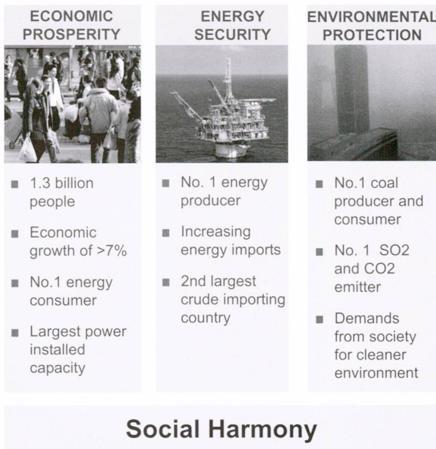
Fig. 1: The strategic drivers for China policy makers.

2012, Shell published its Onshore Oil and Gas Operating Principles. The company is making all of Shell's operated onshore projects where hydraulic fracturing is used to produce gas and oil from tight sandstone or shale, consistent with these principles and with local rules and regulations. The reason for making these public was in response to concern around the development of unconventional resources, especially with regard to the practice of hydraulic fracturing. It creates transparency as the public today demands and allows Shell to share «how we do our business». It also demonstrates confidence, which is based on 60 years of onshore operational experience, including the use of hydraulic fracturing, and underpins how the company works today and how it aspires to improve. The operating princi-