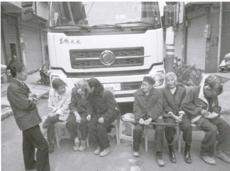
Fig. 5: Peaceful community protest.

Similar to the previously mentioned footprint reduction, successfully working with the community is understood by Shell as a prerequisite for success. People will make their sentiment felt by opposing an activity or blocking progress. Hence, regardless how good the geology is, if the relationship between community and company is not sustainable, the company will not be able to operate efficiently. Fig. 5 shows how easily operations are stopped when a community disagrees with a certain activity – in this case what was considered excessive trucking activity passing through a small village road. Likewise, when the relationship is based on mutual respect and trust, it can be