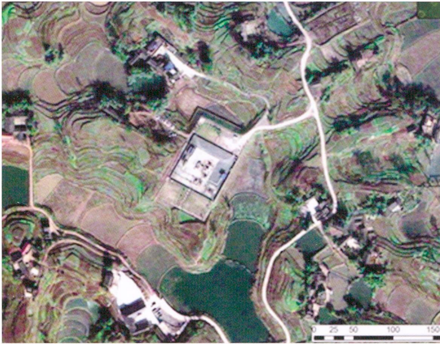
Fig. 3: The challenge of land acquisition in a densely populated province like Sichuan.