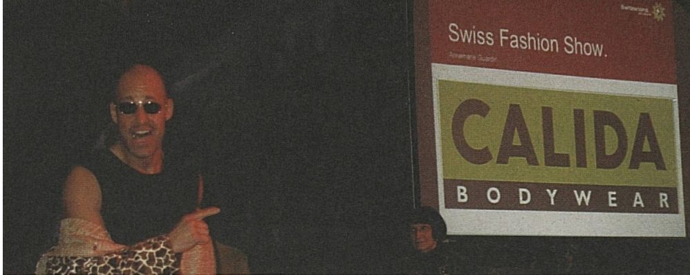
A relaxed party mood prevailed at the opening Swiss-Peaks event in New York.