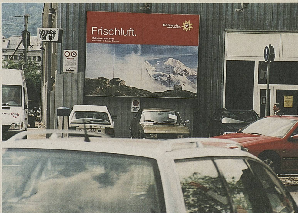
... Switzerland Tourism promoted holidays in the fresh air.

Despite difficult underlying conditions Switzerland Tourism opted for a forward strategy and thus an extensive summer campaign. This also included a review of the campaign by the Dichter Institute, which awarded the posters much better marks than the adverts. The conclusion drawn in the context of Switzerland Tourism was that adverts in newspapers and magazines make sense only in association with a specific offering, and posters only as image advertising.