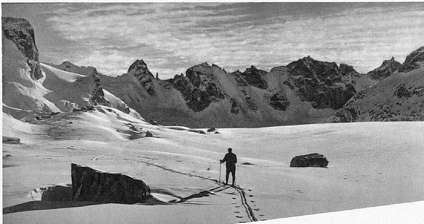
In the Forno district, Oberengadine