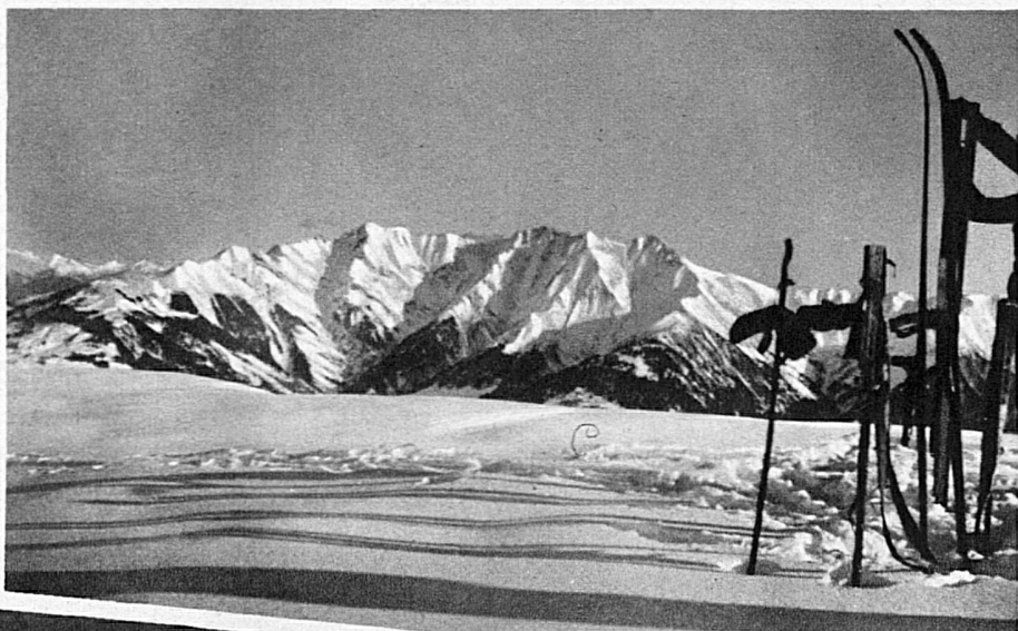
View from the summit of the Piz Mundann into the Lugnez valley

The introduction of ski revolutionised the situation. During a fine spell in January or February huts such as the Concordia