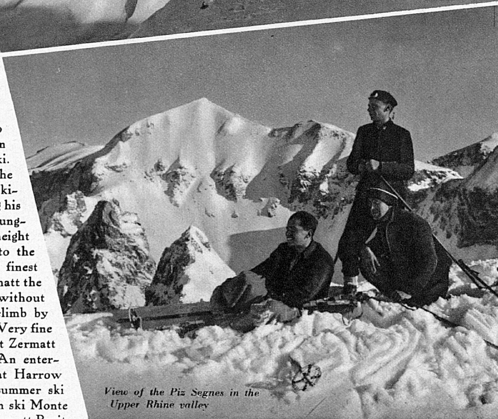
View of the Piz Segnes in the Upper Rhine valley