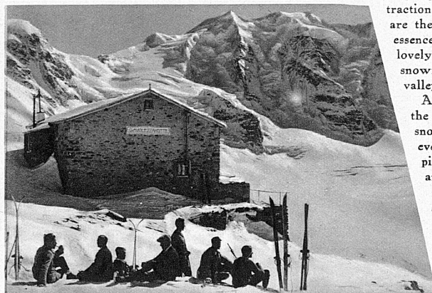
Diavolezza Huts and the Piz Palu

attendant Aiguilles. It was easy to identify not only the great mass of Mont Blanc, but even the lesser peaks on those ridges.