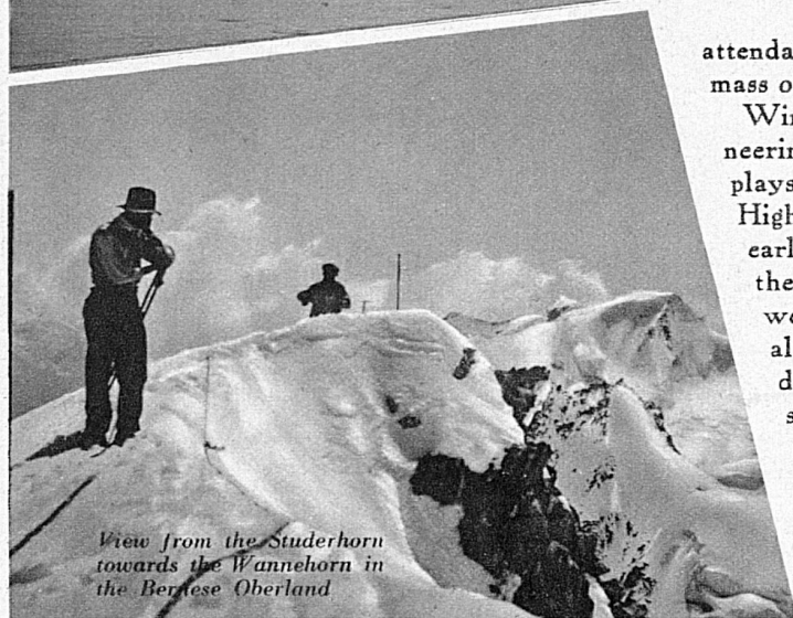
View from the Studerhorn towards the Wannenhorn in the Bernese Oberland