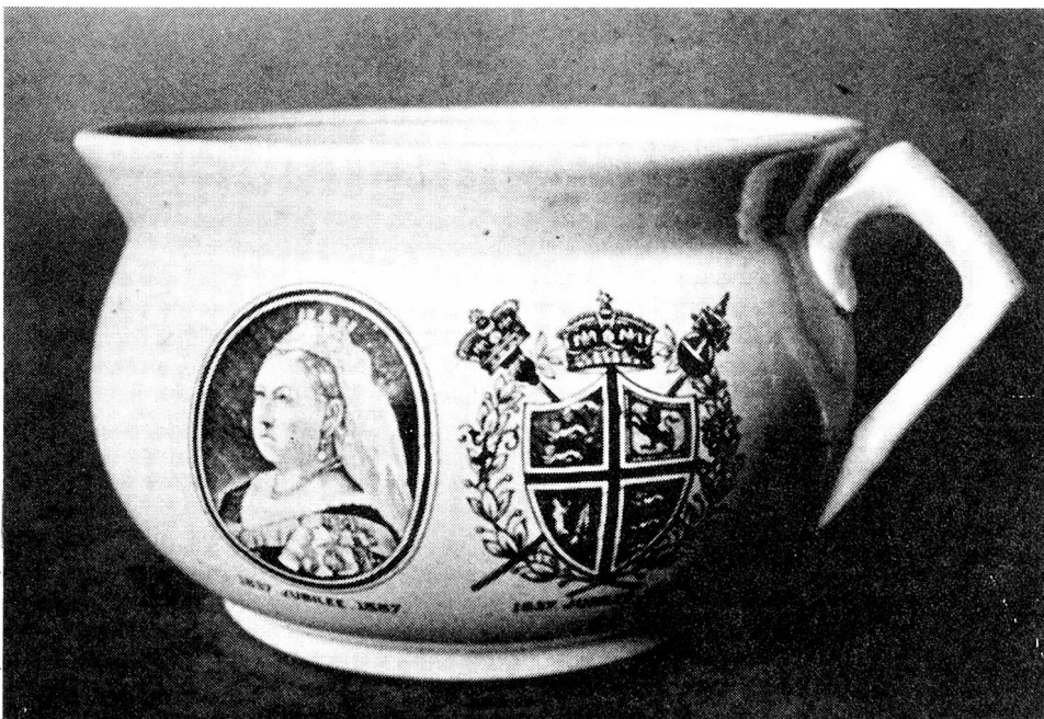
Royal remembrance: An 1887 chamber pot portraying Queen Victoria and valued at £500.

One of the exceptions is Appenzell Ausserrhoden – and the other is neighbouring Appenzell Innerrhoden, where the votes for women move was last turned down in 1982.