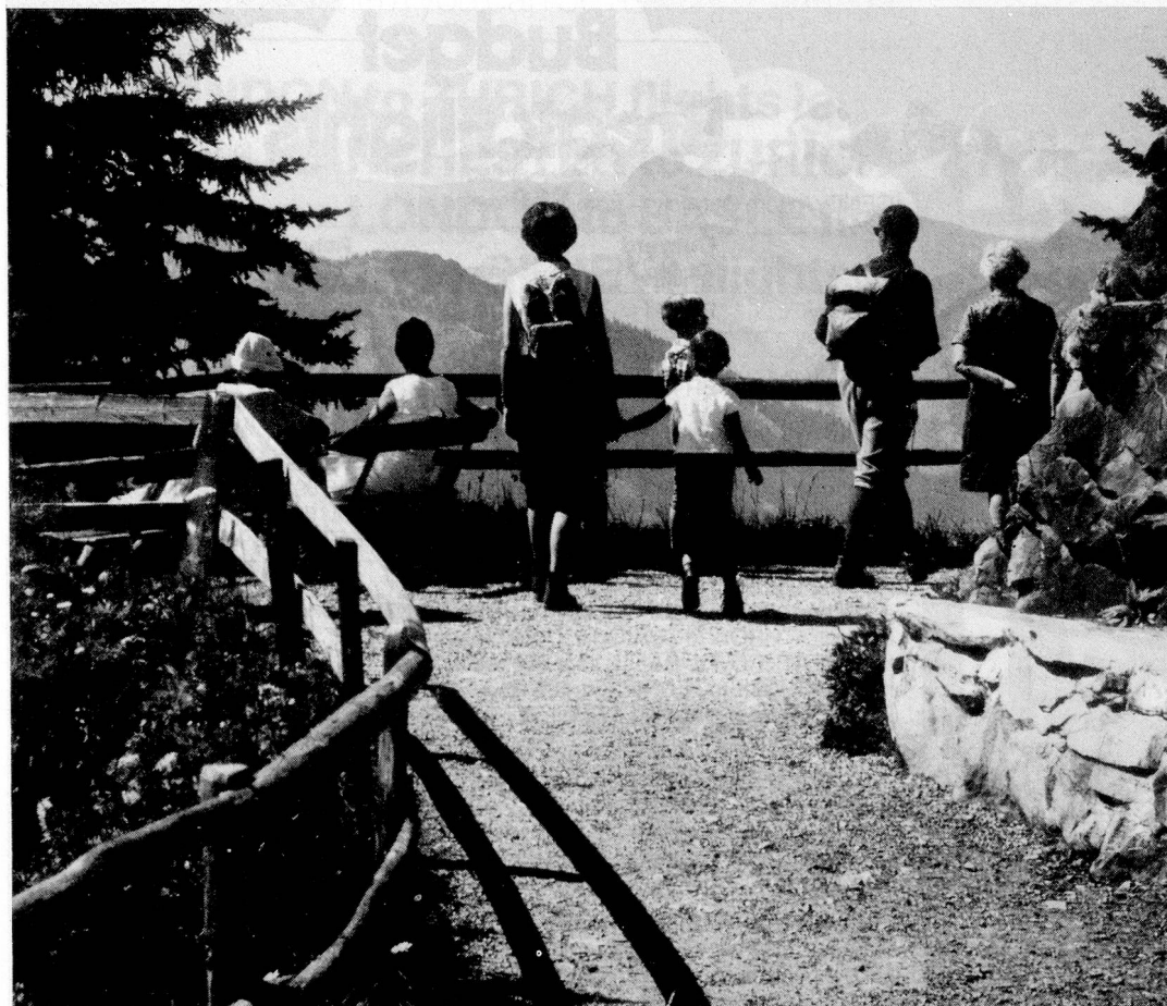
Hikers on the crest trail of the Stanserhorn

BRITISH tourists are re-discovering Switzerland!