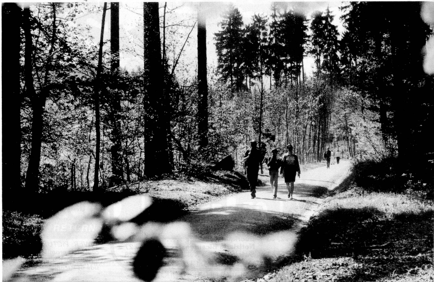
On the Uetliberg above Zurich