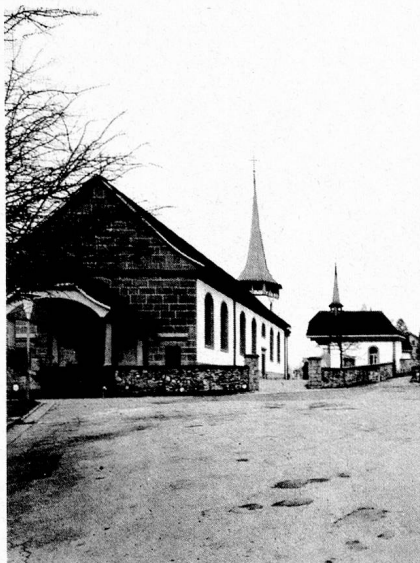
In Tavel (FR), the basically Gothic parish church and the ossuary have been restored