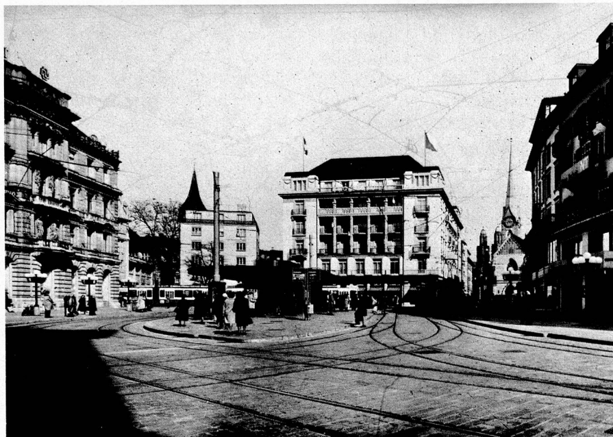
Left, the Swiss Credit Bank, restored in the fifties; centre, the Savoy Hotel, rebuilt with parts of the old façade, Paradeplatz, Zurich

it has contributed financially. On the other hand, the wealthy canton of Basle-City has instituted the system of preventive protection, or official classification. This explains why one of the smallest cantons, which does, however, contain the historically and architecturally important City of Basle, protects more monuments (about 320) than Canton Grisons; and a further 200 are in the process of being placed under protection. Here, as in Canton Grisons, a very rigorous policy is pursued and a building seldom has to be deleted from the list of protected objects. But the record must be held by Canton Vaud , which protects some 1500 objects, of which only about two thirds are buildings, the others being individual articles like bells, chalices etc. This large number is due to the fact that the laws of Canton Vaud, too, provide for official classification, which