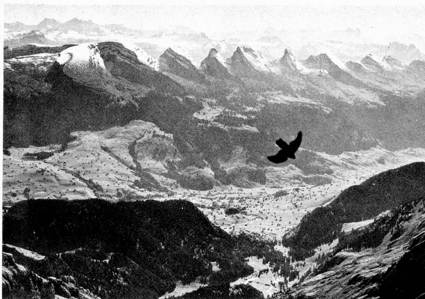
The Säntis offers breathtaking views of the Toggenburg and the Churfürsten.

of Appenzell shows certain parallels in many ways with the liberation of Central Switzerland, one finds similar events and results in the era of Reformation and Counter-Reformation. Like elsewhere in Switzerland, the Reformation could not succeed in the whole Canton. On the other hand, it was impossible to keep Zwingli's teachings out of it. In the Inner Rhoden (districts or communes), the inhabitants remained mostly Catholic, whereas the Outer Rhoden (Urnaesch – Herisau – Hundwil – Teufen – Trogen) professed the new faith. From 1525 to 1588, Appenzell people lived on a footing of equality, more or less at peace with one another. After 1580, the Counter-Reformation pressure from Central Switzerland made itself felt, and suddenly, under the influence of the capuchin monks, Protestant minorities were no longer tolerated in the Inner Rhoden , and they were expelled unless they returned to the Catholic faith. There were quarrels about the Gregorian Calendar and joining an alliance with Spain. All of a sudden one heard the word