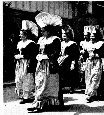
Ladies of Appenzell in her Sunday best

Herisau is particularly interesting, not only because of the circulating of the Klausen carrying huge bells, but because this does not happen on 31st December, but on 13th January according to the old Julian calendar.