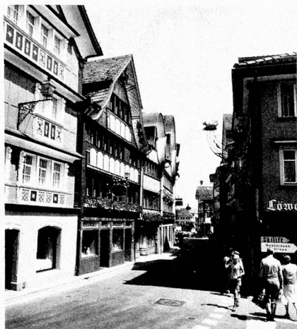
Appenzell's main street

Appenzell scenery has generally kept its peculiar charm. The fact that the economic boom was kept within bounds was probably due to unfavourable communications: just as the Romans did not include the Saentis region in their roadnets, so have the communications pioneers of the recent past left Appenzell alone as unsuitable: It is not accidental that Appenzell is the only Canton which has not a single metre of SBB and will never have a single metre of national roads either. This has cost the Canton dearly in private railways, and the burden has been lessened only in recent times when neighbours and Confederation have given some support.