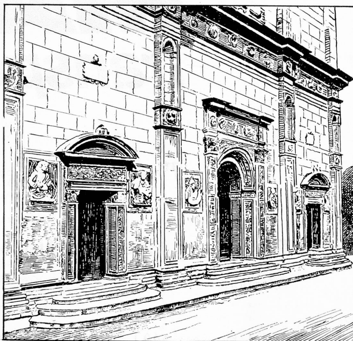
Lugano: San Lorenzo Cathedral

Of all Lugano's churches, the ancient church of Santa Maria degli Angioli (St. Mary of Angels) constructed in 1499, deserves a visit. The wall separating the interior in two parts, holds the celebrated fresco-painting of the Ticinese Bernardino Luini (1470-1533) who was a pupil of Leonardo da Vinci; his angel and woman faces, sweet and meditative, have more charm than those of his master. His famous Passion is of 1521 date. A gracious Madonna (1530) and the Lord's Supper, of beautiful and warm colouration (1533).