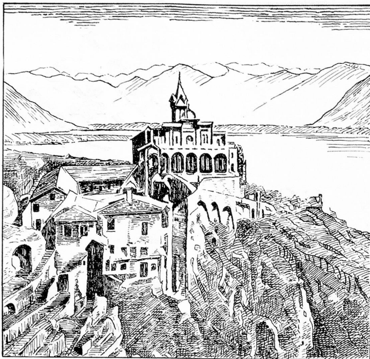
Locarno: La Madonna del Sasso

ing the church, the magnificent panoramic view of the country can be admired.