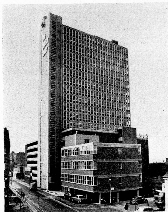
The new and gleaming Zurich Insurance 17-storey tower block in Portsmouth.