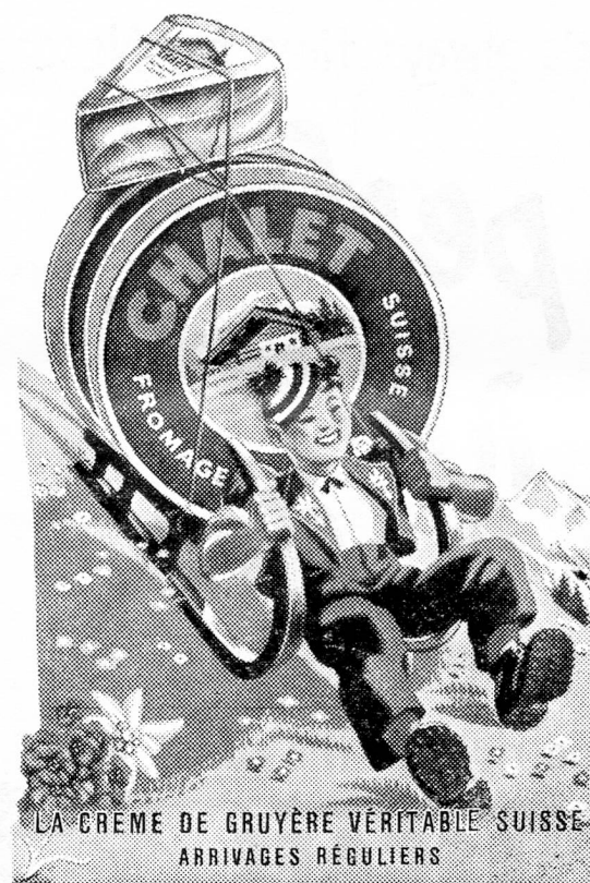
Swiss Chalet Cheese is a real treat for Cheese lovers