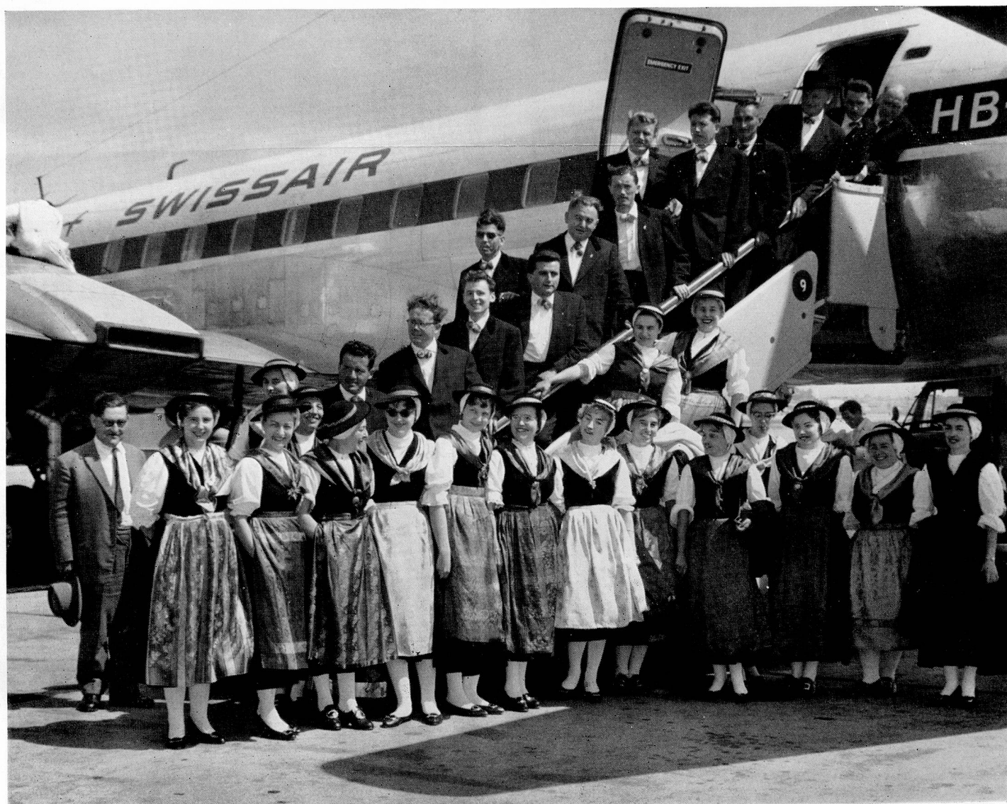
The "Chanson du Rhône" at the London Airport.

"Speaking of Switzerland as the prototype for a future united Europe, may we not liken the Canton du Valais to our Swiss Confederation? The Valais, country of contrasts, with its large fertile plains, deep and narrow valleys reaching to the foot of dazzling white glaciers, its rocky ridges and lofty silvery peaks, and above all the Rhône which in its majestic flow