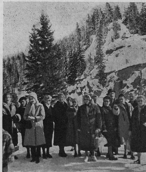
Our traditional excursion to the Rigi-Kaltbad in the New Year of 1960 towards the beautiful winter sun was an unforgettable experience to the guests of our "Home"—Ein unvergessliches Heimat-Erlebnis für unsere "Home"—Gäste war der Neujahrsausflug 1960 an die herrliche Wintersonne auf Rigi-Kaltbad.

«Home» for Swiss Nationals Living Abroad — a «pied-à-terre» in the homeland