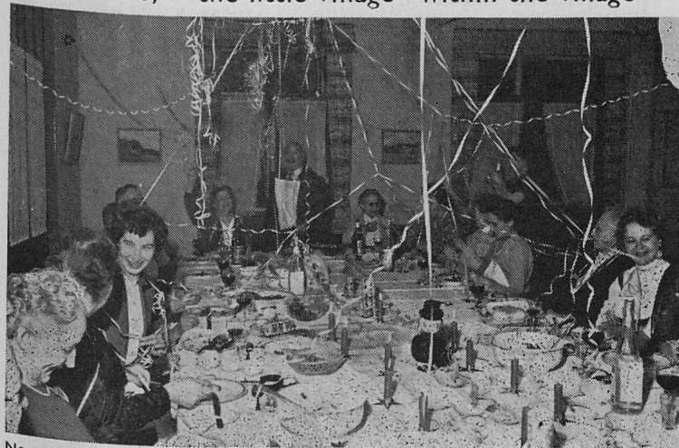
New Year's Eve celebrations, 1959/60, in the cosy family circle of the "Home" community — Silvesterfeier 1959/60 im Kreise der gemütlichen „Home“-Familie.

The "Home," "the little village" within the village