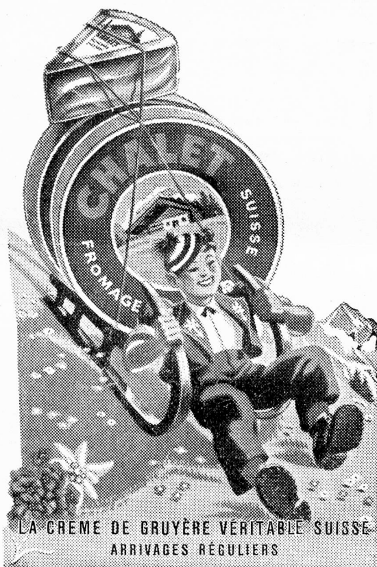
Swiss Chalet Cheese is a real treat for Cheese lovers