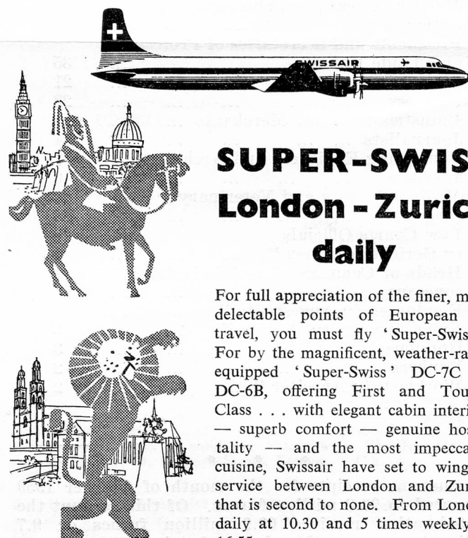
All UK-Switzerland flights are operated in association with BEA