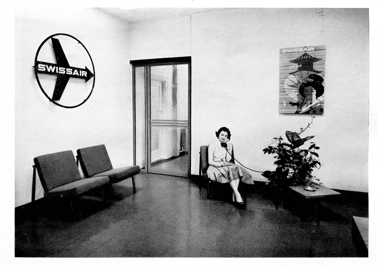
View of the entrance and reception hall of Swissair's new administrative offices in London,

In 1932 Swissair acquired two American Lockhead Orion high-speed machines. In 1935 it replaced its entire fleet with the latest high-speed machines, the Douglas DC-2, and two years later the Swissair fleet was again enlarged with machines of the Douglas DC-3 type. From then onwards followed at short intervals the DC-4, DC-6bs, and DC-7c, and in 1960 the Douglas DC-8 jet liner will be put into service.