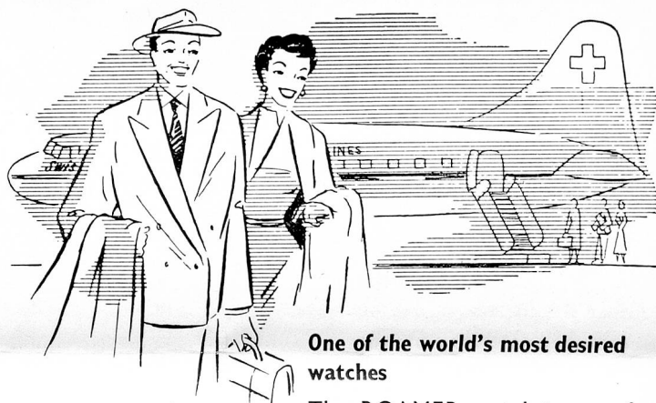
One of the world's most desired watches

Under the interim agreements, combined air/sea passages providing the usual round trip discount can now be sold between the U.K. and Ireland, and Greece, Egypt, the Lebanon, Pakistan, India, Thailand, Hong Kong, the Philippines and Japan, in conjunction with Swissair Far East services.