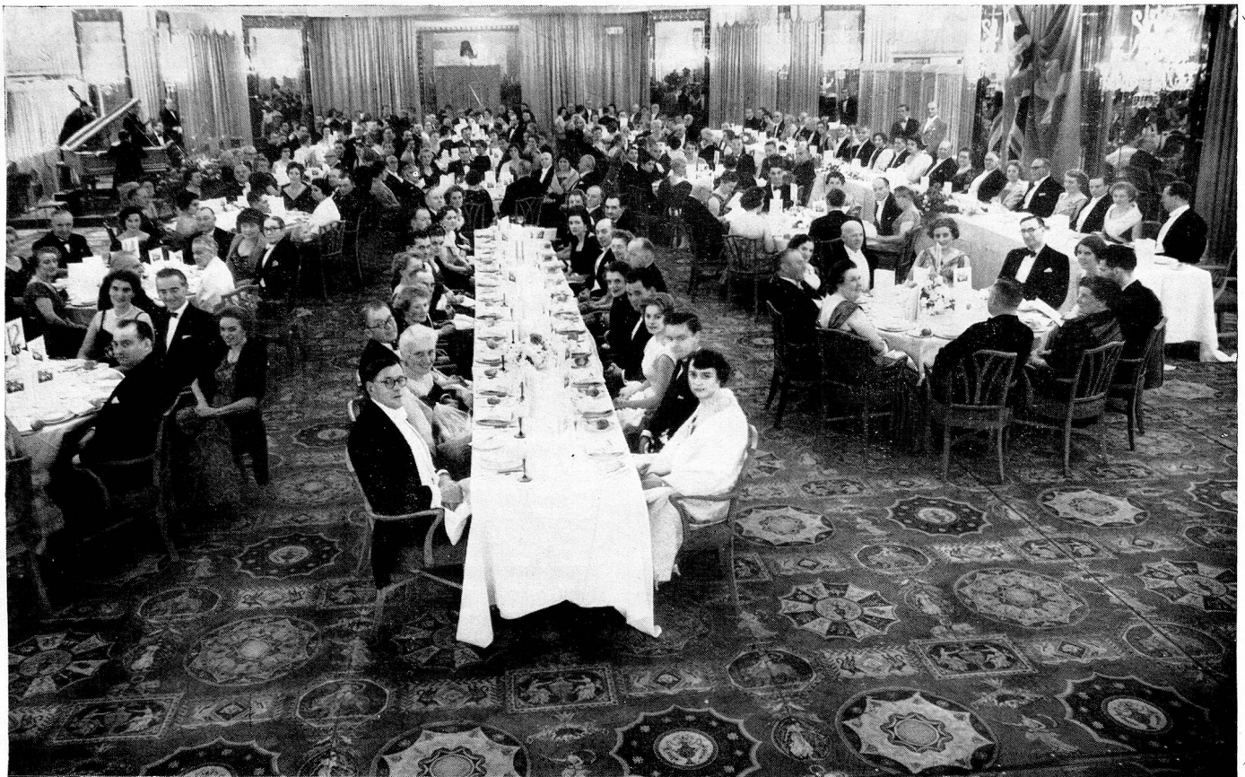
VIEW OF THE BANQUETING HALL.