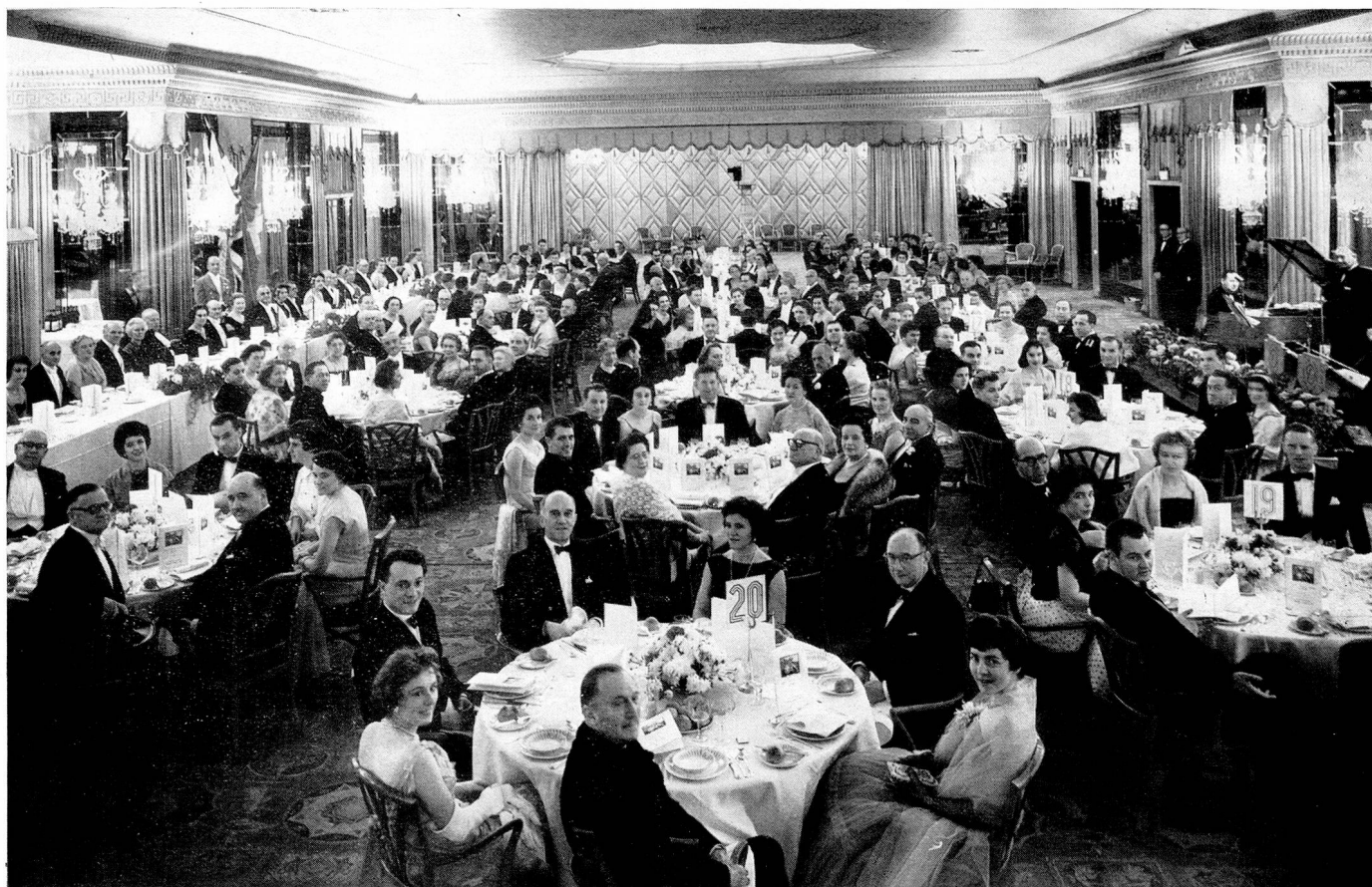
VIEW OF THE BANQUETING HALL.