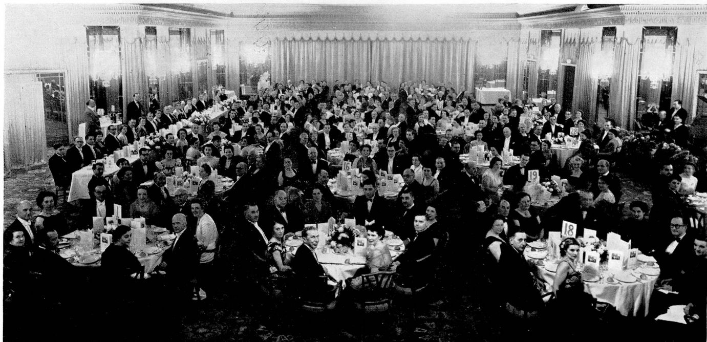
General View of the Banqueting Hall.

The question of women's suffrage has been ventilated to some considerable extent in Switzerland this summer. The trouble is that not only the men but also the women seem to be divided on this point. In fact, so deep was the division amongst our women, that unkind tongues speak of two kinds of "Suisseuses". The "Stauffacherin" who looked forward and the "Bülacherin" who looked backward. Perhaps the