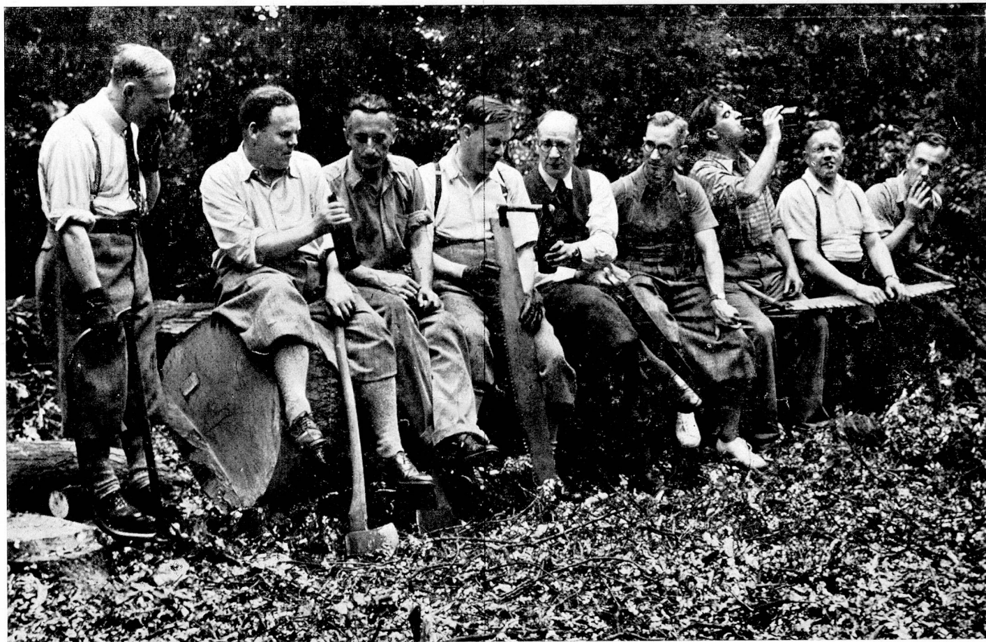
The same resting on their quarry.