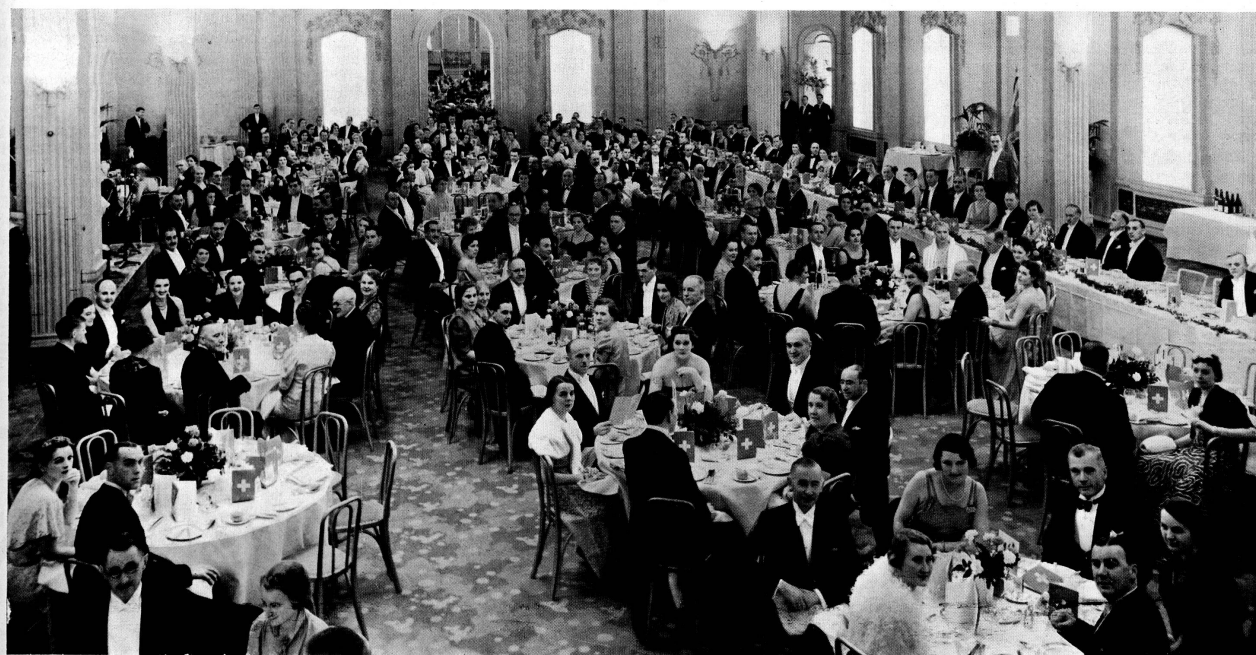
CENTRE VIEW OF THE BANQUETING HALL.

On the contrary, I am going to talk to you about sunshine, and quite a number of bright spots.