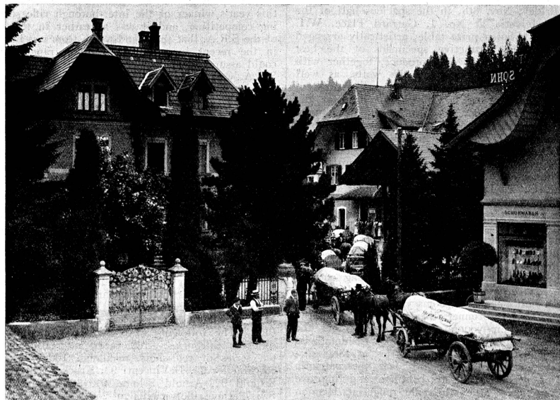
FARMERS DELIVERING "EMMENTALER."

This problem was solved by the admirable expedient of packing the cheese in cardboard boxes, a method which not only commended itself to the Swiss exporter, but met the particular require-