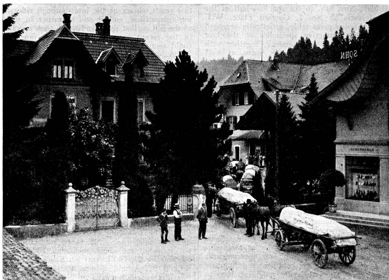
FARMERS DELIVERING "EMMENTALER."

This problem was solved by the admirable expedient of packing the cheese in cardboard boxes, a method which not only commended itself to the Swiss exporter, but met the particular require-