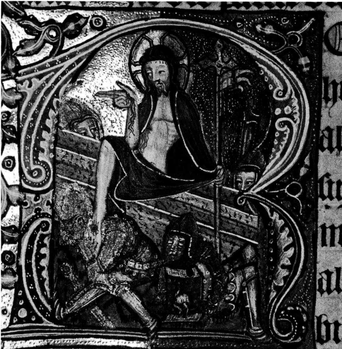
Figure 3: Litlington Missal, Westminster Abbey MS 37, 1383-1384, fol. 95v