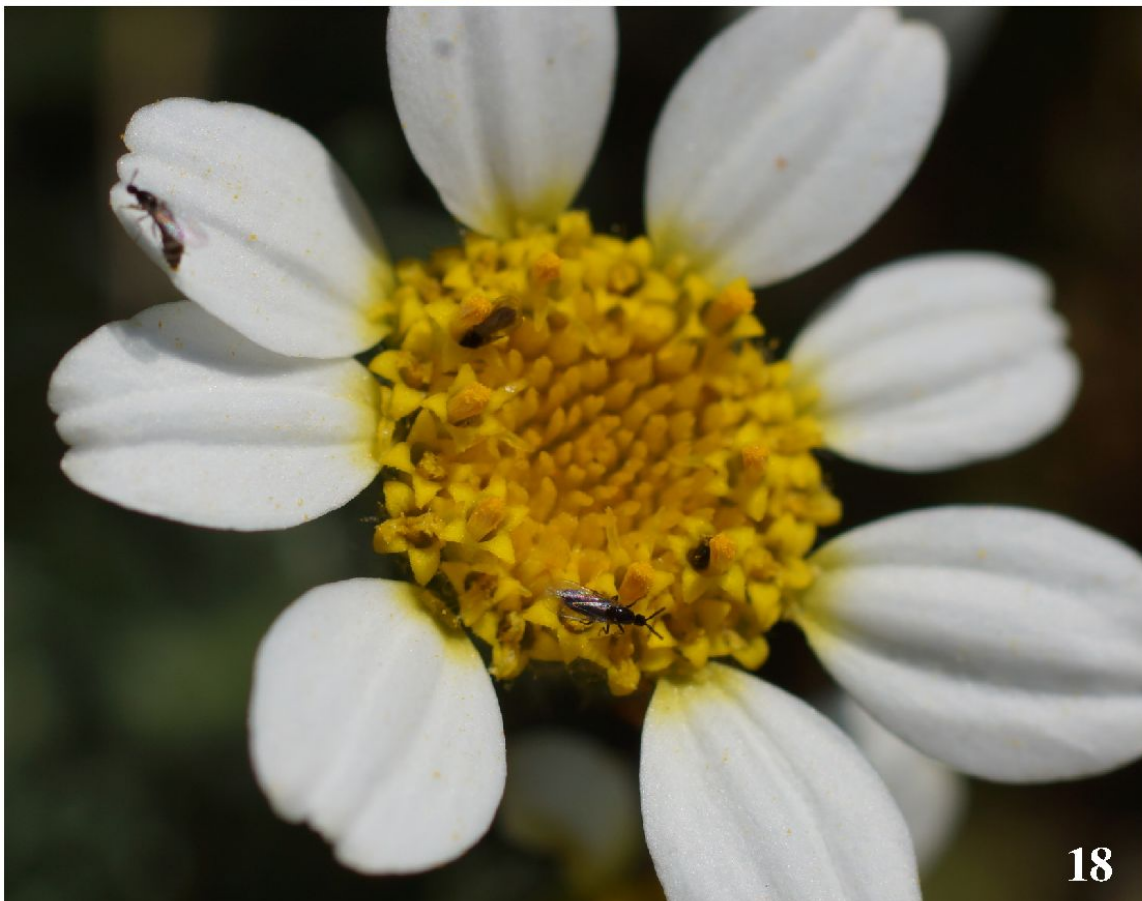
Figs 17–18. Swammerdamella bifurcata sp. nov. on Anthemis sp. in Hormaza (Spain), September 2014. The specimens are covered with pollen, as they enter inside the tubular flowers.