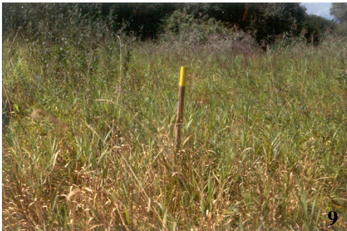
Figs. 8–9: Habitat of Parascatopse distorta sp. nov. in the Bolle di Magadino, lake Verbano, Ticino, southern Switzerland: — 8. Magnocaricetum and Filipendulion (stations 4–5). — 9. Phalaridietum (station 9).