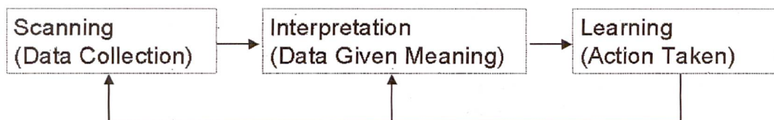
Diagram 1: Organizational Scanning, Interpretation, and Learning (Daft & Weick 2001: 244)

For the processes of interpretation, Daft / Weick (2001) differentiate between three phases that can be transferred to the issues management process: Scanning , Interpretation and Learning (see diagram 1).