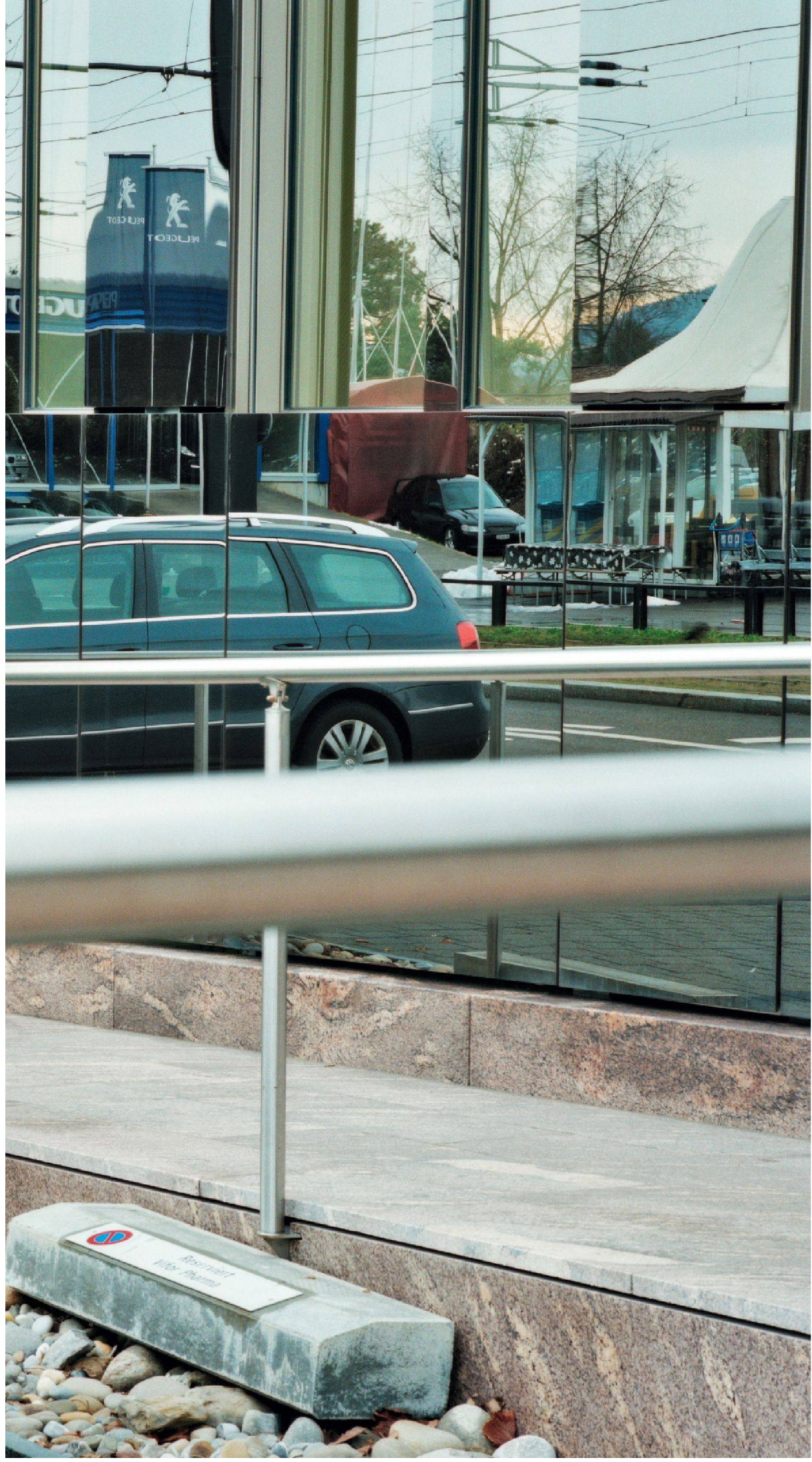
05 The Glattal tramway