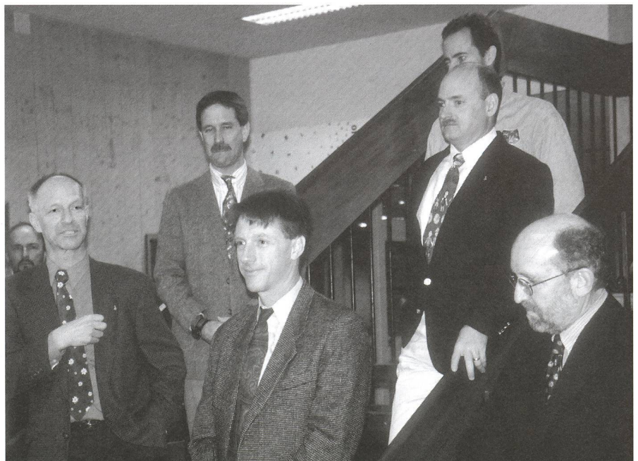
From the left: CLAUDE NICOLLIER, JOHN GRUNSFELD, MICHAEL FOALE, SCOTT KELLY (Pilot) and JEAN-FRANCOIS CLERVOY are greeted by MICHEL MAYOR (lower right).

«Teamwork works very well in a program like this one. In my four missions so far there hasn't been anything more than slight disagreement that was solved rapidly. It's an ingredient of success to have team work, not only with the team in the Shuttle, but teamwork shared with ground support. There has to be good communication. I