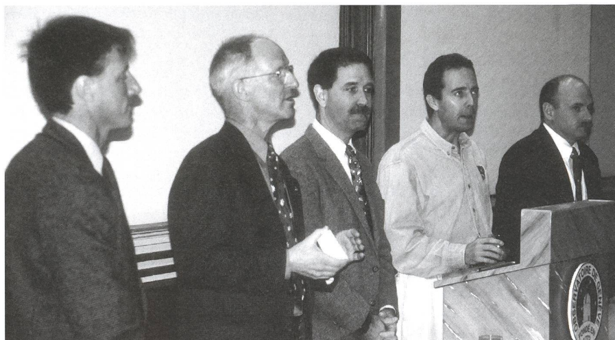
From the left: MICHAEL FOALE, CLAUDE NICOLLIER, JOHN GRUNSFELD, JEAN-FRANCOIS CLERVOY and SCOTT KELLY describing their mission

won't wake you up. I slept really well. I seemed to get by with less sleep than on the ground.»