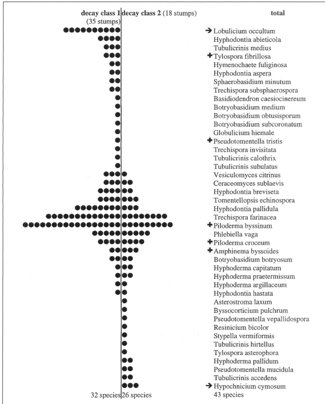
Fig. 2: Corticioid fungi in brown rotted stumps of spruce distributed on decay classes. Decay class 1 is the least decayed stumps. Each dot (●) represents one stump where the species have been sampled. Total record: 43 species. Notice that 35 stumps represent decay class 1 but only 18 decay class 2. In consequence of this the species frequencies are biased towards decay class 1. Seventeen species were only found in stumps of decay class 1 while 11 species were restricted to decay class 2. → denote significant preference for decay class. + means known ectomycorrhizal species.