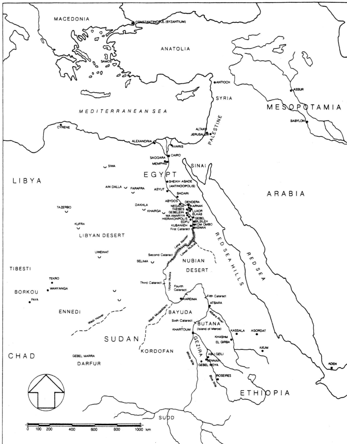
Fig. 3. The Nile Valley.

From Sylvia Hochfield/Elizabeth Riefstahl (eds), Africa I. Antiquity. The Arts of Ancient Nubia and the Sudan, The Essays (Brooklyn, N.Y. 1978) map 1.