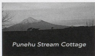
Punehu Stream Cottage