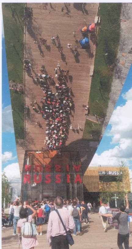
Russian Pavilion

At the end of the EXPO, the towers were dismantled and planned to be erected again as greenhouses in different Swiss cities. As such, the Swiss Pavilion served many different functions and made its point with information, and was therefore truly inspiring. SW