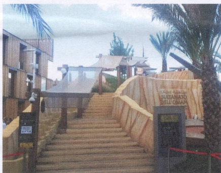
Oman Pavilion