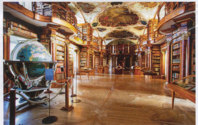
The famous Library (Stiftsbibliothek) of the Abbey of St Gall http://www.st.gallen-bodensee.ch/de/