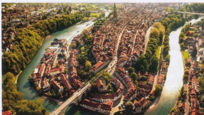
Birdseye view of the Old City of Berne (Nydegg church and bridge at the eastern tip of the peninsula in the foreground)

The final urban expansion of the medieval period took place in the 14th century. It was marked by the Christoffel tower which was demolished later in the 19th century to give way to new streets and Berne's railway station.