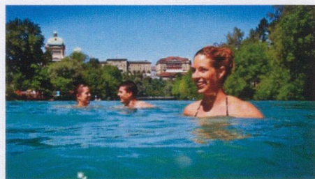
Aare River at the Marzili

One of us Marzili lifeguards was rostered on that shift and at the end of the shift, they would drop you off at the furthest point so you could get a long swim back to the Marzili and continue on your next shift.